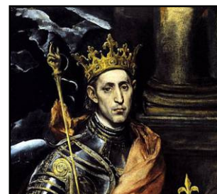
St. Louis IX, patron, Secular Franciscan Order

August 2 – Our Lady of the Angels of the Portiuncula (feast); 4 – Saint John Vianney, priest of III Order. (memorial); 7 – Blesseds Agathangelus and Cassian, priests and martyrs of I Order (optional memorial); 8 – Holy Father Dominic, priest founder of the Order of Preachers (feast); 11 – Saint Clare of Assisi, virgin of II Order (feast, solemnity for II and III Order nuns); 14 – Saint Maximilian Kolbe, priest of I Order (memorial); 17 – Saint Roch, member of III Order; 19 – Saint Louis of Toulouse, bishop of I Order (memorial); 21 – Saint Pius X, pope, member of III Order (memorial); and 25 – Saint Louis IX, king, member and patron of III Order (memorial).